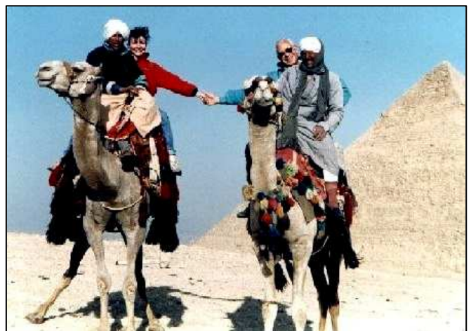
Holding on after the quake (or "Riding with the Taliban")

* I learned later that this film depicts the 1940 collapse of the Tacoma Narrows Bridge in Washington—as the result of wind-induced torsional oscillation, not an earthquake.