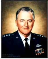
Paul K. Carlton Gen, USAF (Ret) Apr 14, 1921 -- Nov 23, 2009