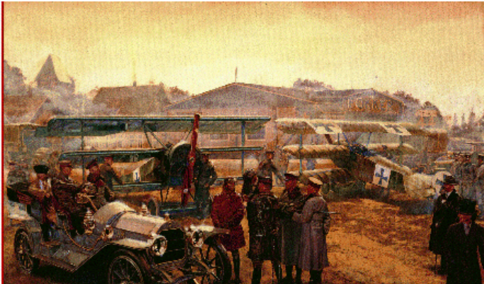
Dawn Patrol promotional material.