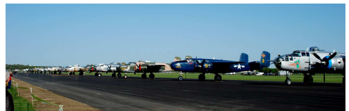
(Below) Static display of the 17 B-25s/PBJs that were flown in for the event. 16 B-25s flew the original mission.