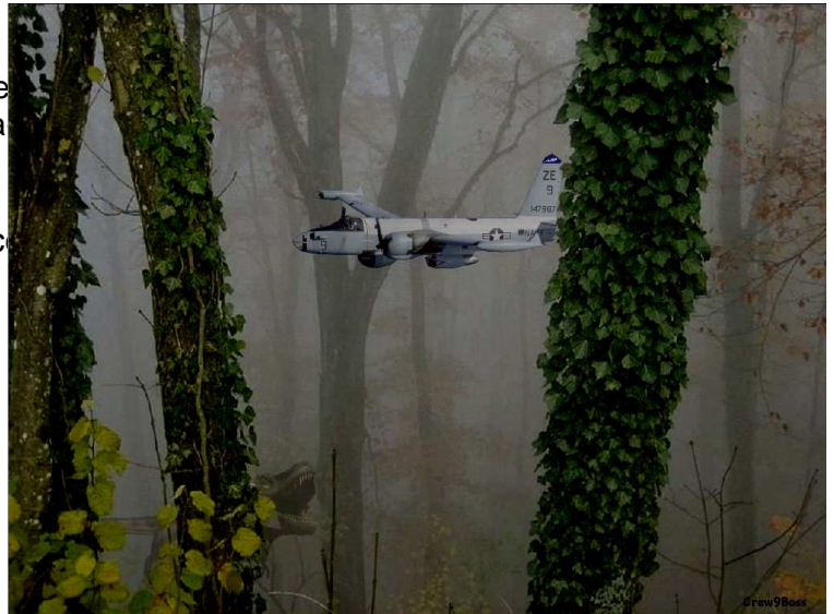
The Gator Swamp ILS—a bit tricky in the goo

I used to work in a fire hydrant factory. You couldn't park anywhere near the place.