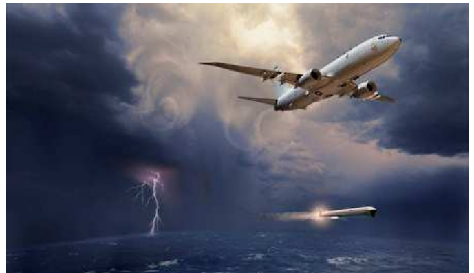
Below – The Navy's P-8 Poseidon advanced maritime surveillance aircraft now operational in the Pacific.

More about this militarized 737 on Page 8