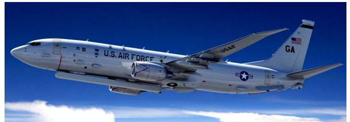
Above – Boeing's proposed P-8 Air Ground Surveillance (AGS) aircraft for the USAF.